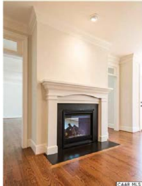
Dominion Development Company trademark feature. See thru hearth. Black slate surround.