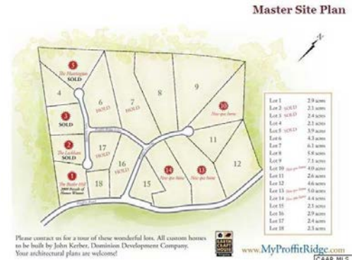
Profit Ridge Community. Lockhart III now complete on lot 14.