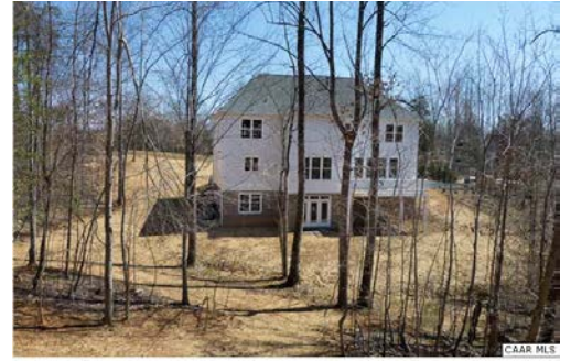
4.4 acre homesite.