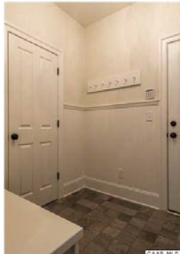
Convenient mud room with designer tile flooring, bench and waincoting. Floor is Del Conca Tile. Slate.