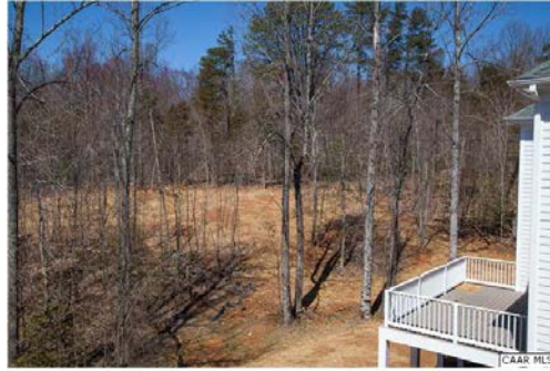
Enormous open space for children and pets to play!