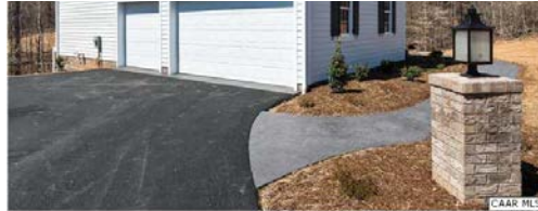
3-car garage. Convenient sink located in garage.