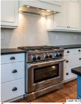
Commercial gas range. Ceramic tile back splash is Horus Art Tile. Tiffany Biscuit Crackle finish.