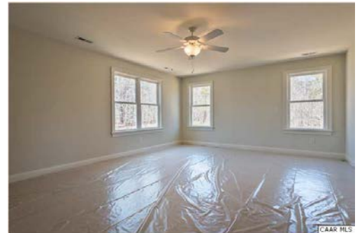
Second level master suite