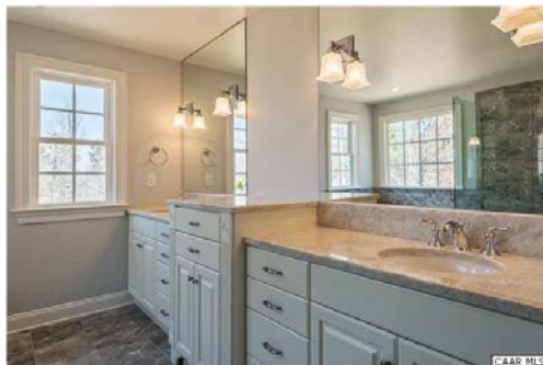
Master suite bath with elevated vanity