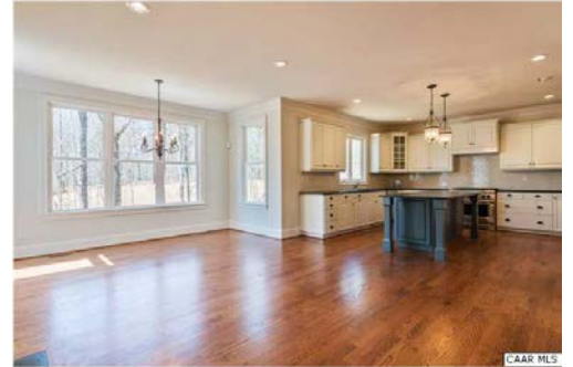
Taken from Hearth sitting area looking into kitchen.