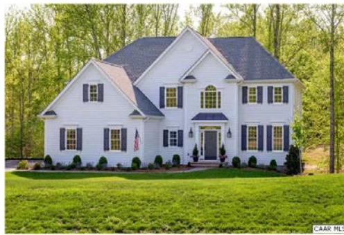
The Lockhart III, NOW COMPLETE!! What an opportunity to own a brand new luxury home on 4.4 acres in one of the county's loveliest communities.