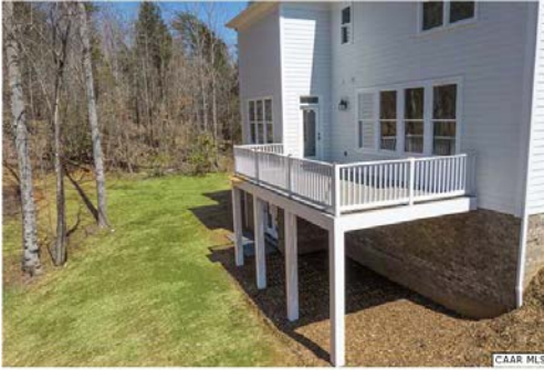
Back deck overlooks a very private and natural setting.