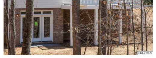
3-LEVEL HOME. Unfinished walkout terrace level awaits your imagination.