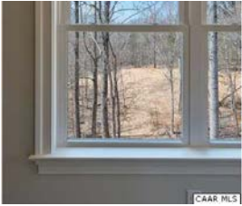
View from master suite bedroom window to the back yard.