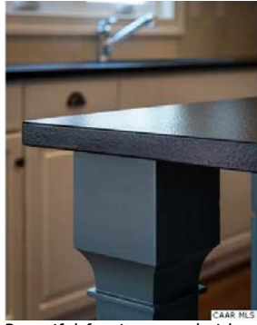
Beautiful furniture grade island, Countertops are Honed Absolute Black granite with pencil eased edges.